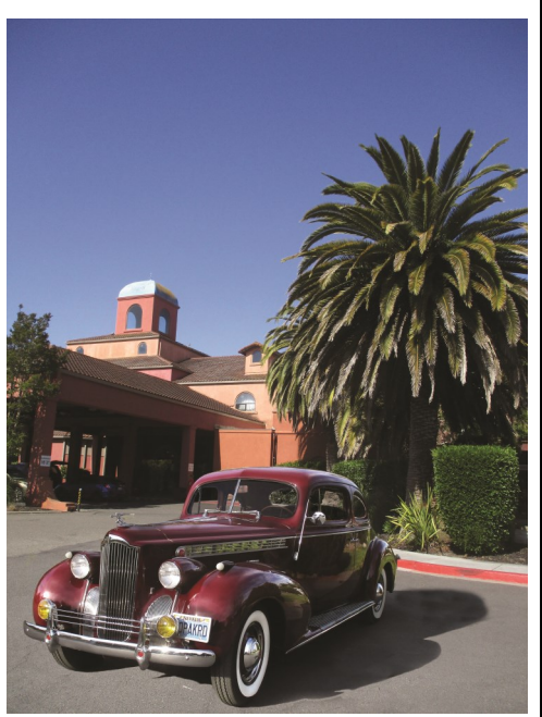
Silver Circle Member Greg Titus' 1940 120 Coupe parked at our host hotel.

for the latest information and to fill out the online registration or download the paper registration form. The link to reserve your hotel room is also on that site. Note: Despite what the website may say, there is no daily parking charge! Remember, your master registration covers the ad-