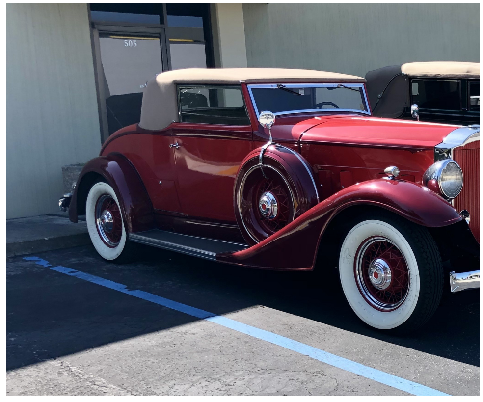
Outside the building that houses the Bertolotti Collect and Clint Moore's 1932 903 Eight Deluxe (