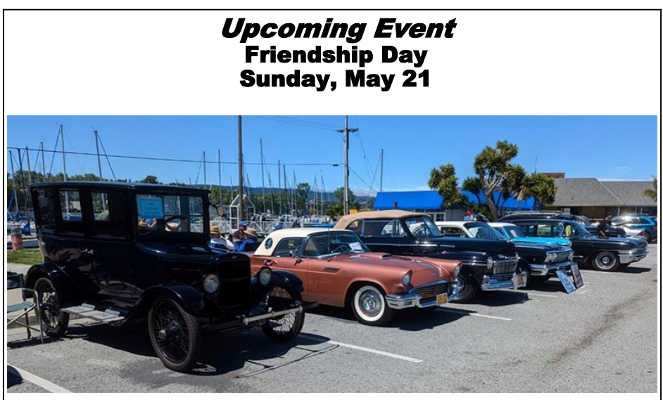
A photo from Friendship Day 2022 showing the variety of cars in attendance.

Join your friends from Nor Cal Packards as we participate in the 60th annual Friendship Day organized by the Mid-Peninsula Old Time Auto Club on Sunday May, 21. Arrive as early as 8am and stay through lunch! If turn out is anything like other similar events this year, it should be packed! This is a casual event for all Bay Area clubs, and there is sure to be a wide variety of cars.