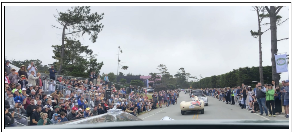
Crowds line the streets at the start of the Tour d'Elegance.

and road damage to deal with when we got back? All of these questions loomed loudly in my head. Fortunately, I had nothing to fear because the Packard performed flawlessly. After complementary donuts and one too many cups of coffee, we started our engines and slowly crept with the traffic toward the towering starting arch. As we rounded the corner onto Portola Road which was packed with cheering onlookers and passed the grandstand filled with beaming spectators, the spectacle of it all finally sank in on my bewildered sister, who stated, "This is like the Oscars of the car hobby!" To which I responded, "Duh!" The route wound its way out of Del Monte Forest, and we were finally on the open road - 30 beautiful miles of breathtaking coastline to Big Sur. All along the route were crowds of people and photographers precariously perched on cliffs and in trees trying to snap that elusive perfect picture of each passing vehicle. Because the route doubles back on itself to return to the starting point, we were afforded the opportunity to see most of the cars coming in the opposite direction, as if we were traveling a road 75 years in the past. Once across the finish line (checkered flag and all!), we