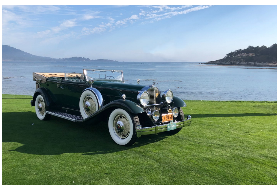
Obligatory waterfront glamour shot.