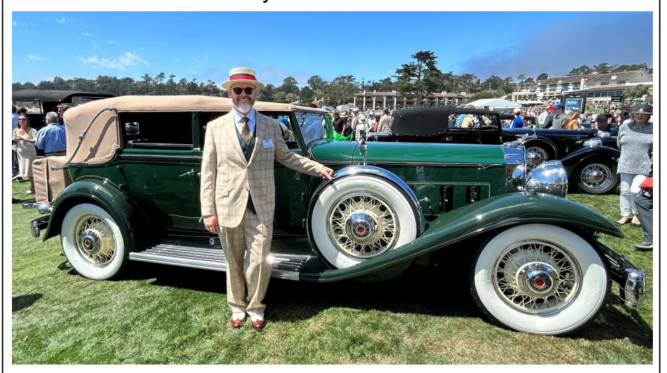
Beaming in my period outfit in front of "Marlene the Dietrich" at the Pebble Beach Concours d'Elegance.

It has been a lifelong goal of mine to take a car to Pebble Beach, and when I purchased "Marlene the Dietrich," my 1932 903 Eight Deluxe Convertible Sedan, with its eye-catching two-tone green paint and movie car provenance, I hoped it would be my chance. After 7 years, 3 application attempts and 1 global pandemic, I finally got a coveted invitation.