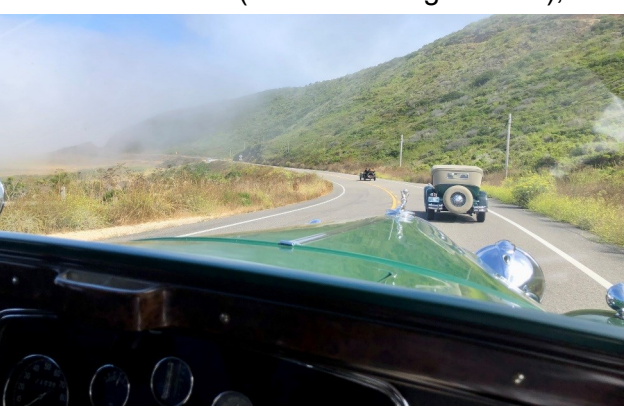
(Continued on page 12)