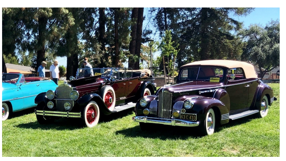
940 110 Sedan, Cumming's 1940 110 Station Wagon, the Lubich Family 1953 Clip-Deluxe 8 Dietrich Phaeton and Wheeler's 1941 160 Convertible.