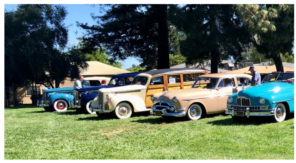
Packards at Portal Park: (l to r) Toland's 1940 110 Convertible, Higgins' 1940 1 per, Moore's 1950 Super Deluxe Victoria, Heley's 1929 Delux