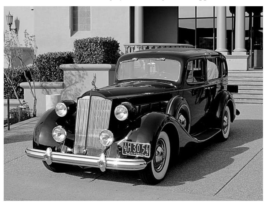
Eddie & George Beck's '37 Super Eight..