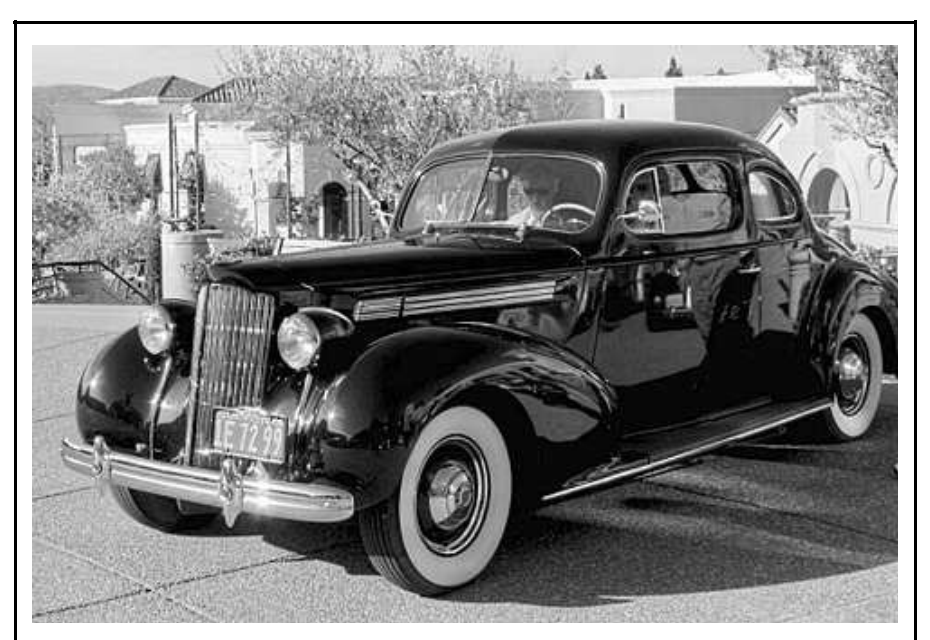
Pam & Fred Hill arriving in their '39 1701 Eight coupe.