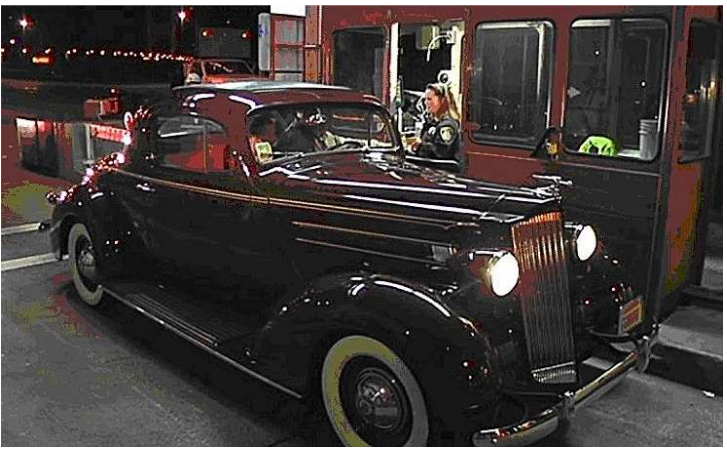
The last car to pay cash on the Golden Gate Bridge was this '37 Packard owned by the Bridge District.