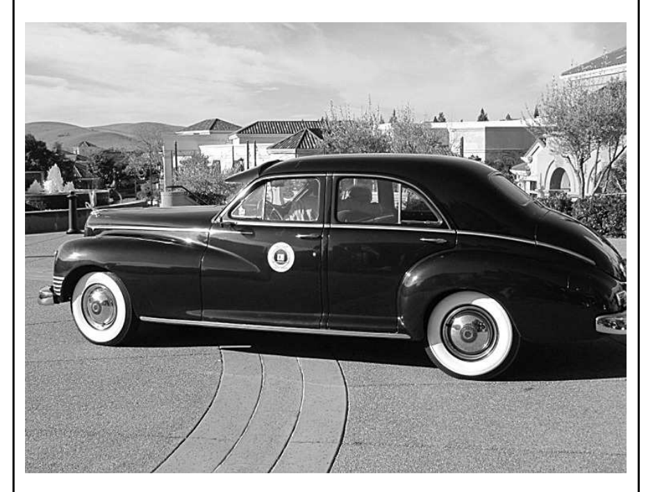
Carolee & Milt Wheeler brought their '47 Custom Super Clipper.