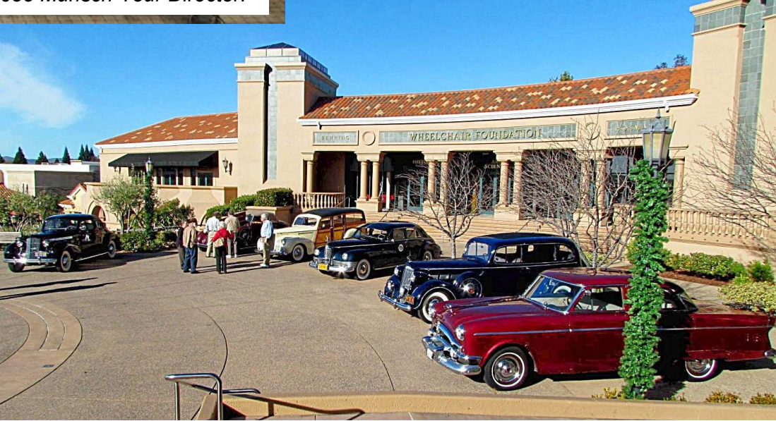
A Day at the Movies at the Blackhawk Museum.