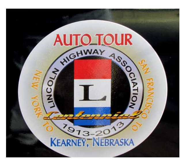
The sign on the Wheelers' car told of their travels.