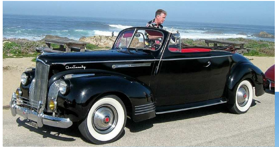
Laughlin '41 120