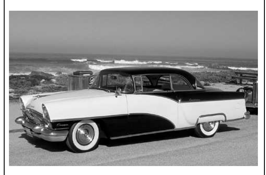
The Atherton's '55 Clipper Constellation Hardtop.

fifteen miles down Hwy 1 to the Rocky Point Restaurant. There we enjoyed a beautiful lunch with a marvelous view of the Pacific coastline.