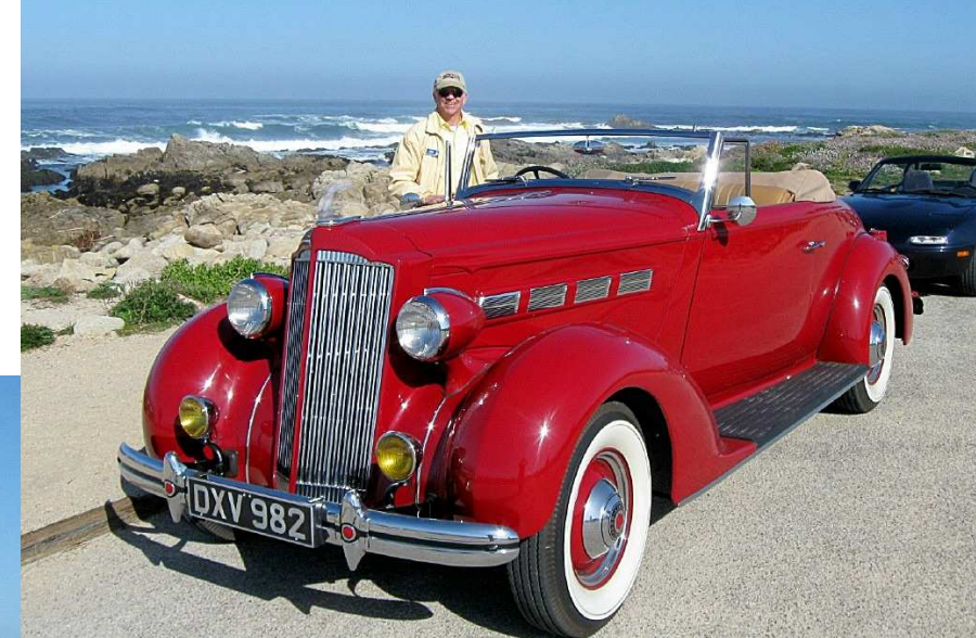
O'Connor '37 120

Wheeler '34 1101 Toland '40 110 Pava '36 1401