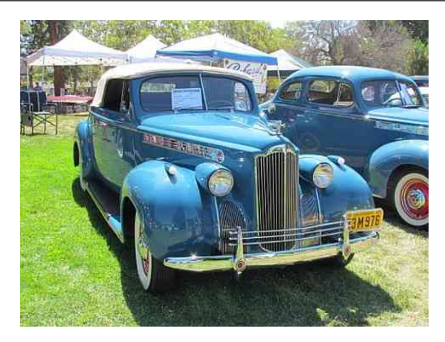
Tim & Kathie Toland's '40 110 convertible.