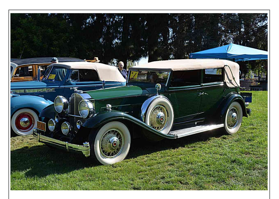
Clint Moore's '32 903 Dietrich convertible sedan