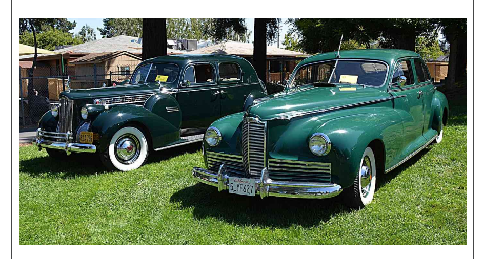
The Butterworths' '40 1806 club sedan (left) The Bretts' '41 Clipper Eight sedan (right)