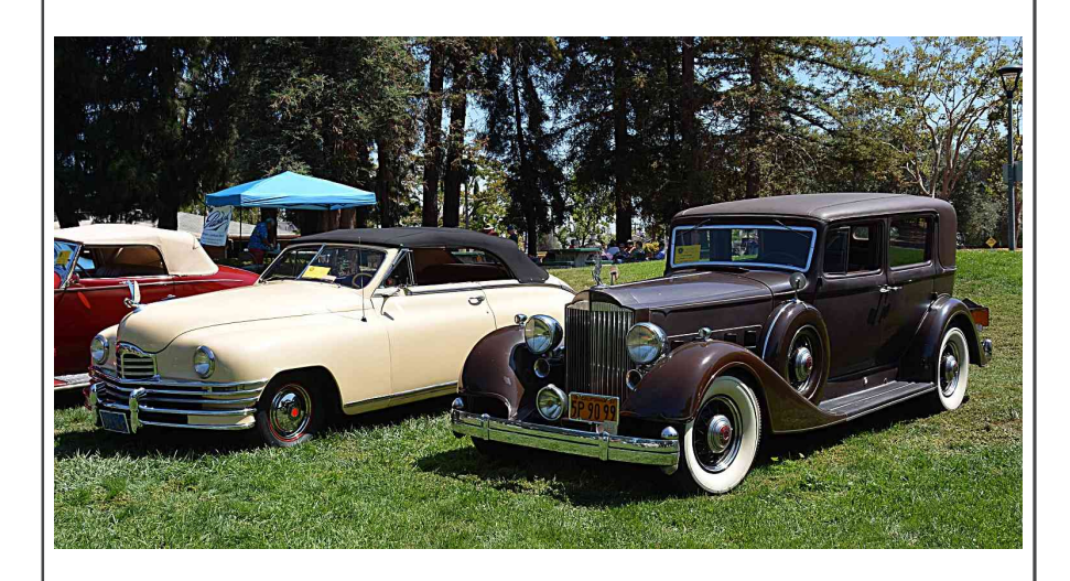
Milt & Carolee Wheeler's '48 Super Eight convertible (left) Stuart Hunter's '34 Twelve formal sedan (right)