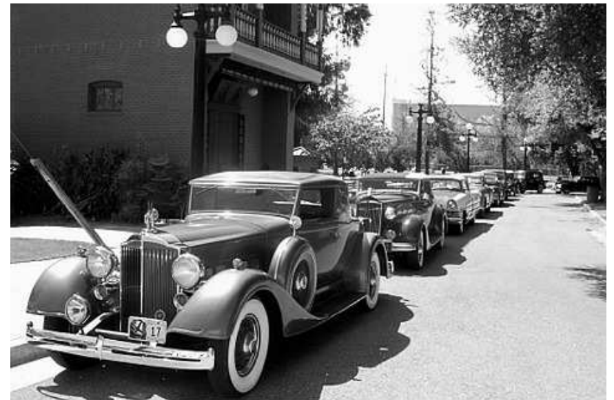
Wheeler's '34 1101 stationary coupe, O'Connors' '37 120 convertible coupe, and Hills' '55 400 hardtop.