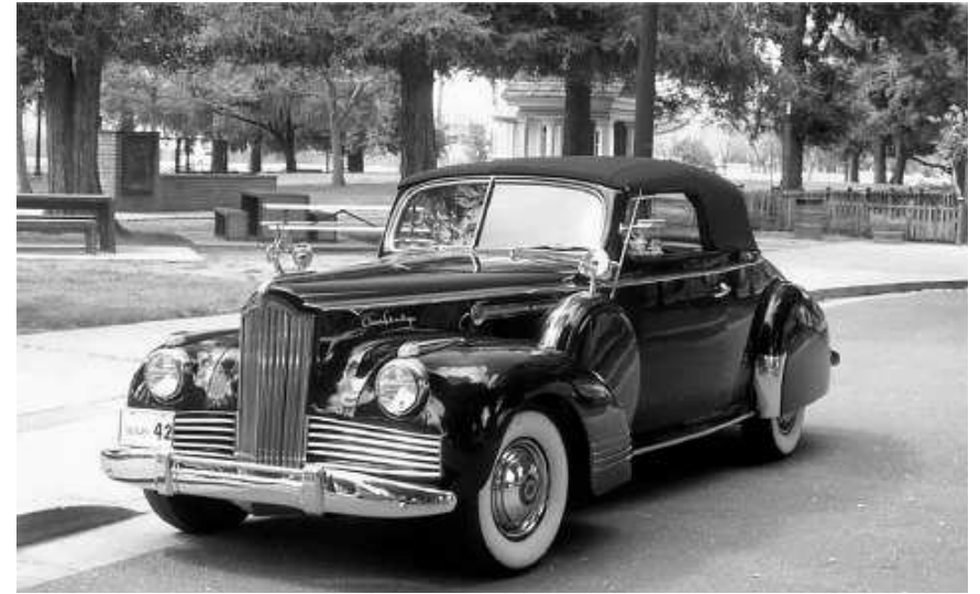
John and Lorraine Blackburn's '42 160 convertible coupe.