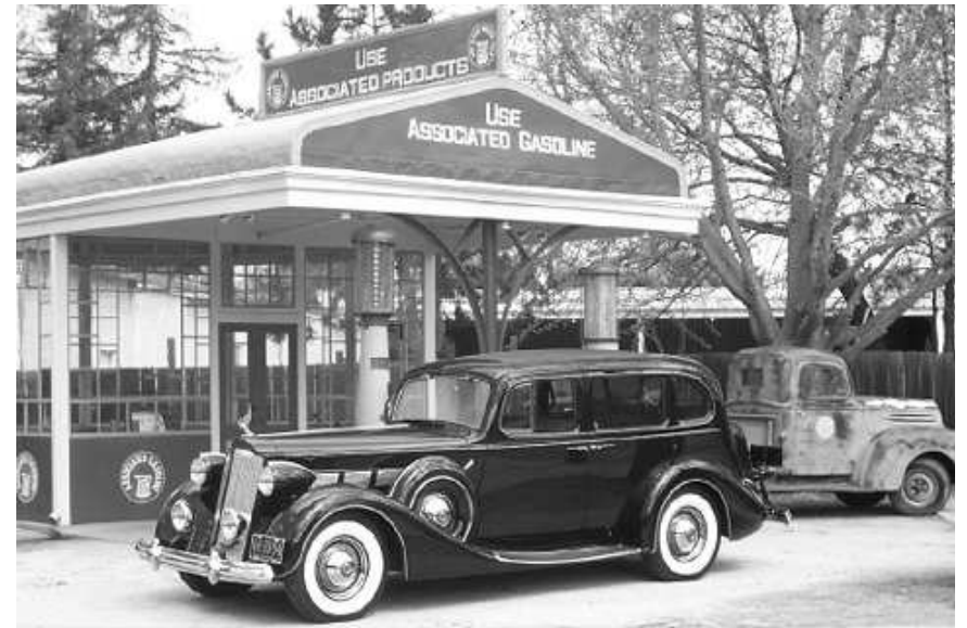
George & Eddie Beck's '37 Super Eight.