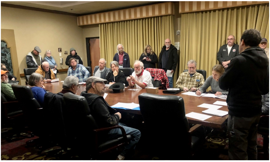
Initially it was standing room only at the volunteer event held at our host hotel on February 26!

The next edition of the Pious Pelican will be the final one before the meet. Look for those final details and if you have any questions before then, do not hesitate to call or email!!