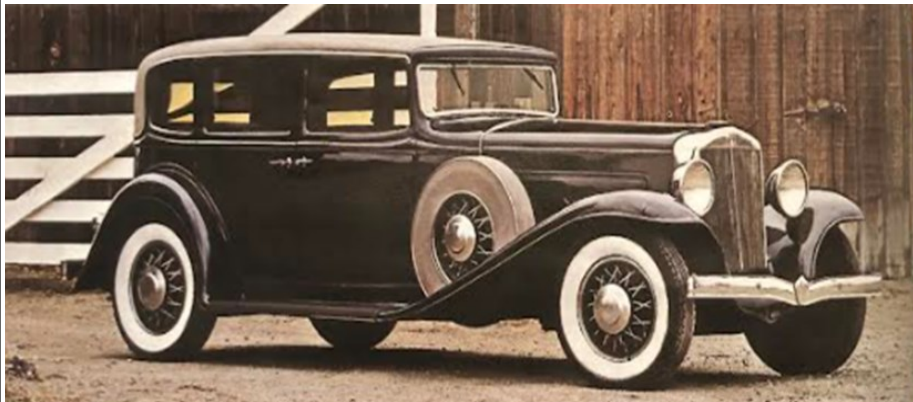
Experimental Twelve-Cylinder Front Wheel Drive Car, 1932

In 1929, two front wheel drive automobiles came on the scene, the L-29 Cord manufactured by the Auburn Motor Car Company and the Ruxton.