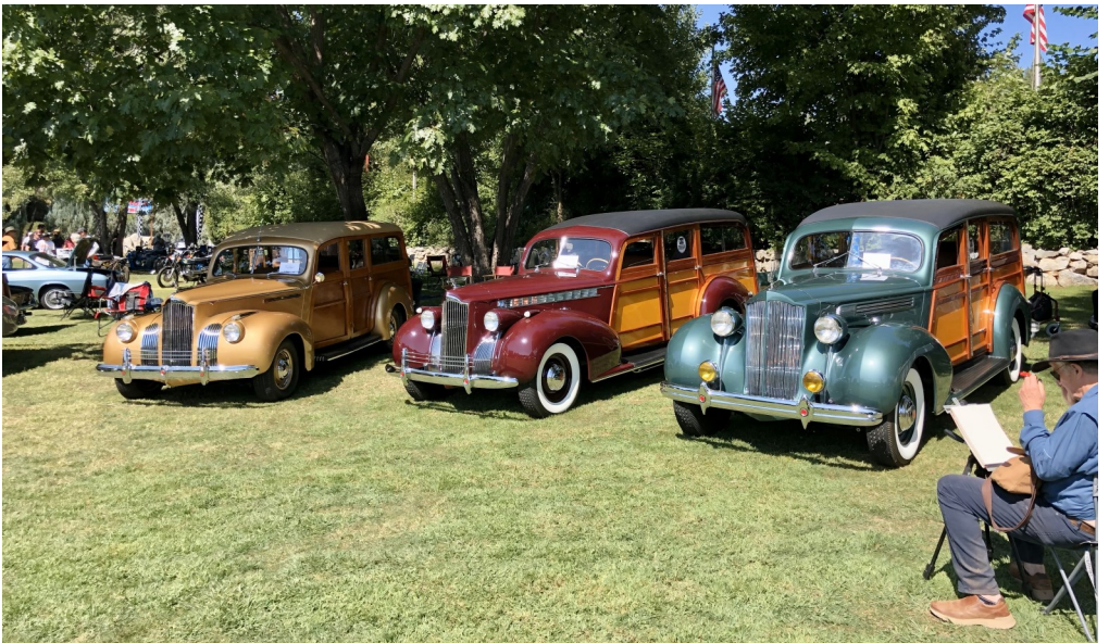
An artist sketches 3 of George Myers' woodies at Ironstone: (l to r) 1941 110 Station Wagon, 1940 120 Station Wagon by Cantrell and 1939 120 Station Wagon by Cantrell.