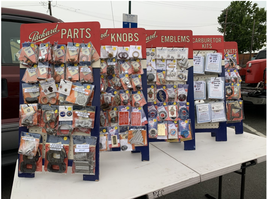
Just one of the tables displaying Packard wares!

Parts, parts and more parts! The annual swap meet brought our favorite vendors back to the parking lot of the USA World Classics Event Center in Valejo for a day of consumerism, consultation and camaraderie. A healthy turnout kept the day lively as people recounted tales of triumph and woe taking place in garages and shops around the Bay Area.