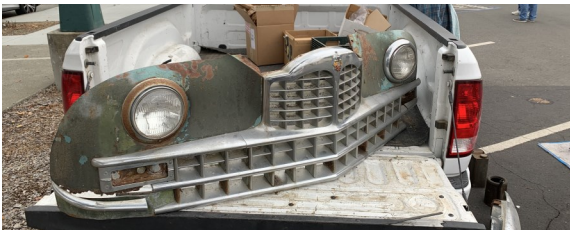
The front end of a 22nd/23rd Series car was ready to find a new home at the swap meet.