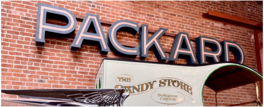
The Candy Store's restored Packard dealership sign looms above the club's delivery truck and an Airflow hood ornament.