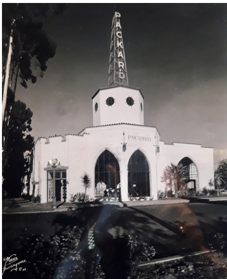
The Candy Store, shortly after it was built as the Packard dealer in 1928.