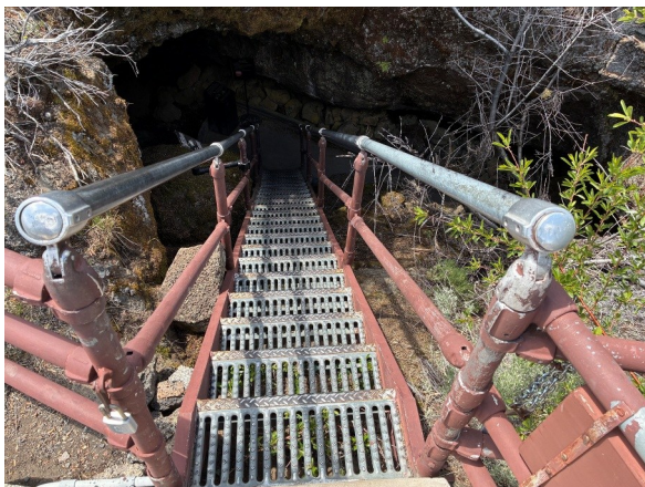
Stairs down into the dark lava tube. Let’s hope there isn’t an eruption!