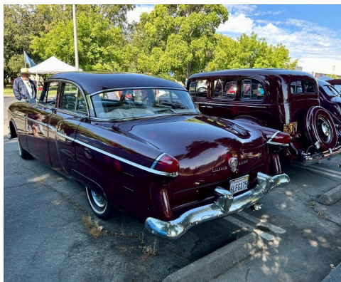
Bill Young's 1953 Clipper Deluxe soaks up the shade next to Rod Dahlgren's 1935 Cadillac 355 Sedan.

around the facility so that those veterans who couldn't make it to the parking lot where our display was were able to see the cars as well, many of them in wheel chairs waving from windows and porches.