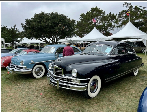
A 1948 Super Deluxe Club Sedan next to a 1950 Lincoln Coupe at the Mecum auction.

a nice variety. After a few years during which Carmel's town council successfully shunned most events, much to the chagrin of the local business owners, it was nice to see activity back in downtown. If you're thinking of a show where your Packard would be welcome, this is a good one!