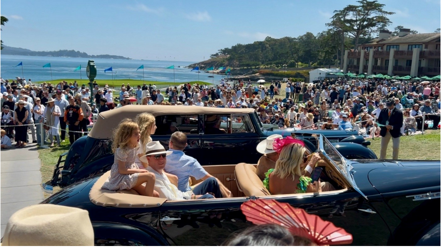
Packards lining up in front of the crowd to see who will win best in class at Pebble Beach! Foreground: 1940 Custom Super Eight Darrin Convertible Sedan. Background: 1938 1608 Twelve Convertible Sedan.

Another crazy week on the Monterey Peninsula has come and gone, and even though the focus increasingly favors European sports- and supercars, plenty of Packards and other classics are still around. The news loves to belabor the negative aspects of the week (e.g., the poor behavior of entitled participants, the spontaneous sideshows in strip mall parking lots and the scores of self-proclaimed social media “influencers” trying to capture at any cost or peril that elusive perfect photo that will expand their online brand), however for those of us bent on enjoying the more traditional events, it’s definitely still worth the trip. While there is plenty to report on from the Little Car Show (cars with engines under 1,800cc’s) to the German “Legends of the Autobahn” show, I’m going to focus on Packards.