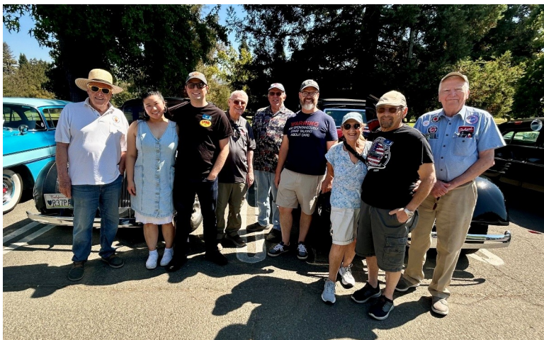
Nor Cal members who turned out to honor our veterans in Yountville.