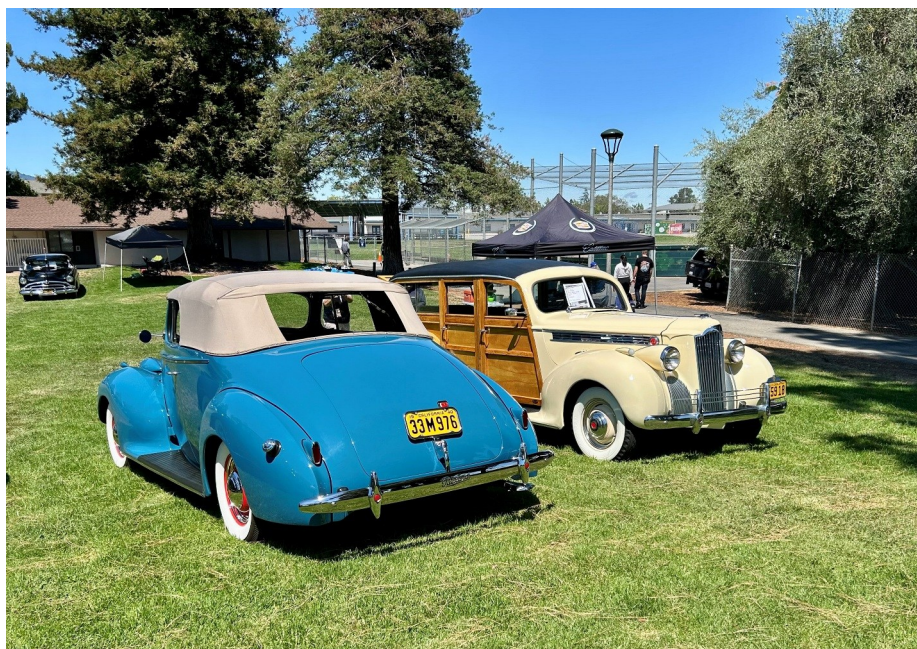
Above: Tim & Kathie Toland's blue 1940 110 Convertible and Bruce & Rhonda Cumming's yellow 1940 110 Station Wagon almost make it seem like Easter at Portal park! (with Zane Buck's Hudson in the distance)