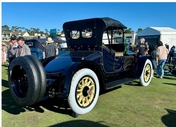
A 1917 2-25 Twin Six Runabout on the lawn at Pebble Beach Concours d'Elegance.

terest in the hobby shifting to European custom bodied and touring cars, the Pebble Beach Concours d'Elegance continues to have a dedicated Packard class every year, and this year the selection of our revered brand did not disappoint! There was also an interesting Chrysler centennial