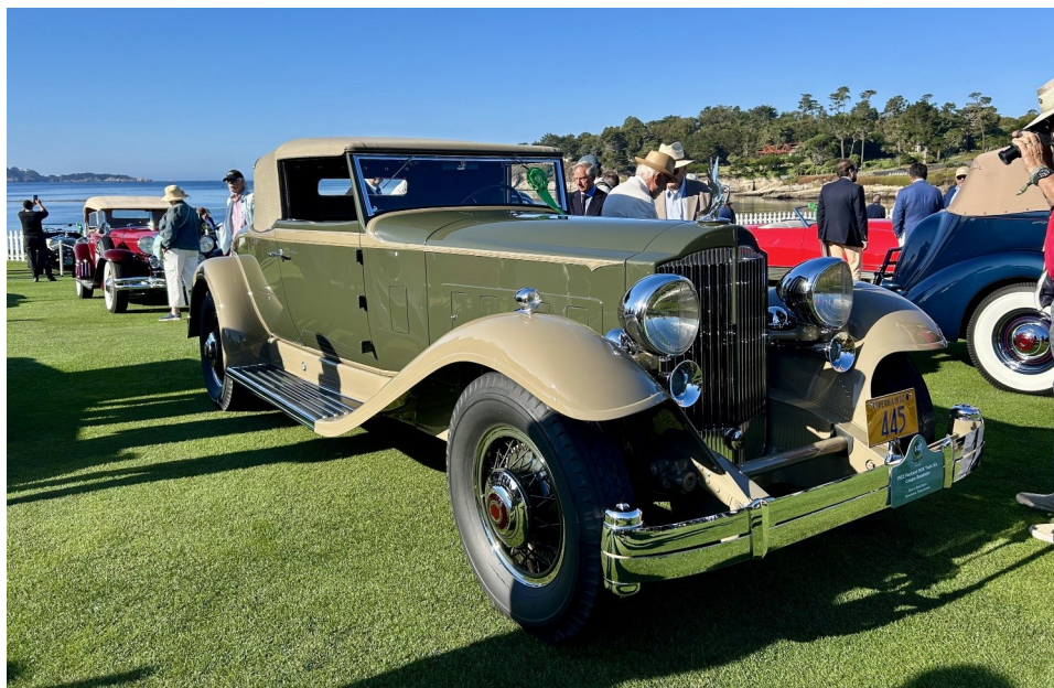
Facing Page Top: Lost in the throng of spectators at the start of the Tour d'Elegance, a 1915 Packard 3-38 Six Five-Passenger Phaeton makes a sharp contrast with the 1960 Plymouth XNR, an asymmetrical concept from the Virgil Exner design retrospective class.