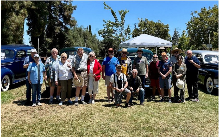
Our happy group at Portal Park.