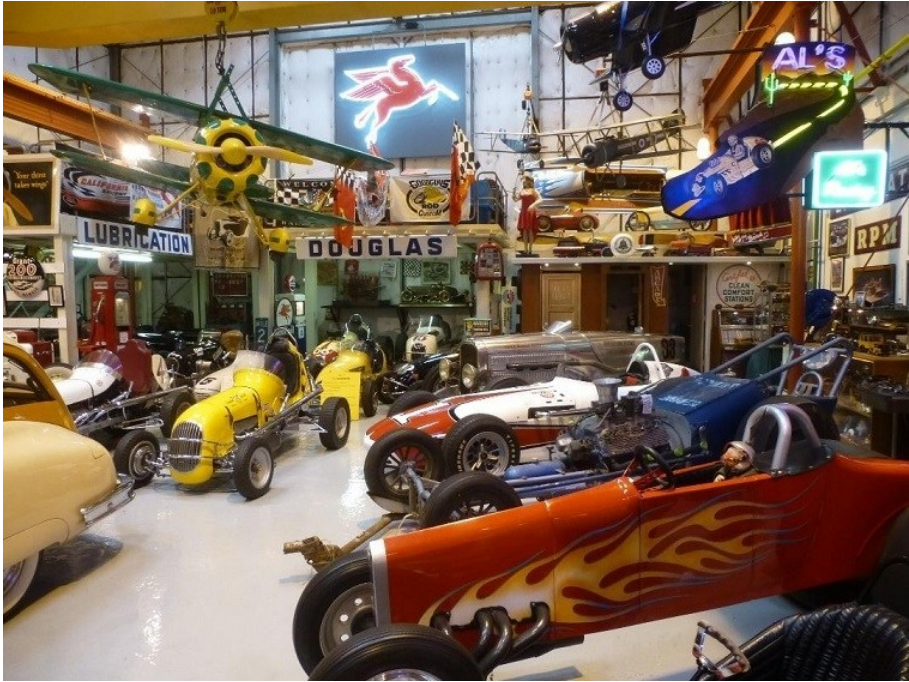
Just one corner of Al Engel's "garage." Note the 1948 Packard Station Sedan rear quarter at the far left!

For decades, Al Engel has been amassing an unbelievable collection of everything transportation-related, and on Saturday March 14, Nor Cal Packards will have the special opportunity to visit Al's garage and museum. Come see rare vintage cars, hot rods, motorcycles, large-scale model airplanes, engines and motors of all types, neon signs, clocks, gas pumps and more! And there's at least one Packard in there: a 1948 Station Sedan.