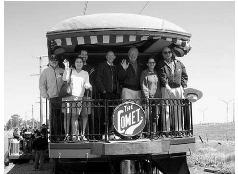
All aboard! See next page...