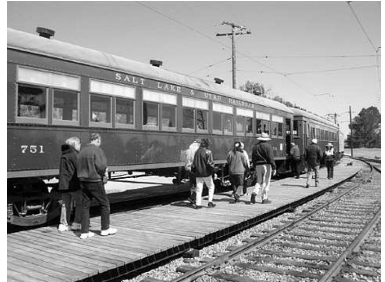
Our vintage 1914 "Salt Lake & Utah" private parlor car.