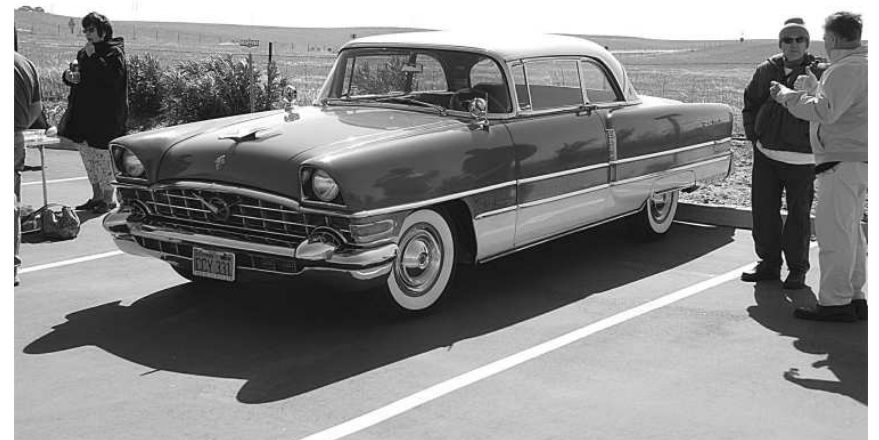
Phil Sherman's 1956 400 hardtop next to table with coffee & donuts.