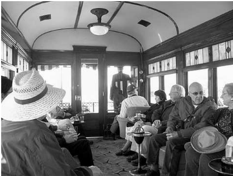
Comfortable swivel chairs, original leaded glass windows, and authentic smoking tables marked "Pullman" added to the ambiance.