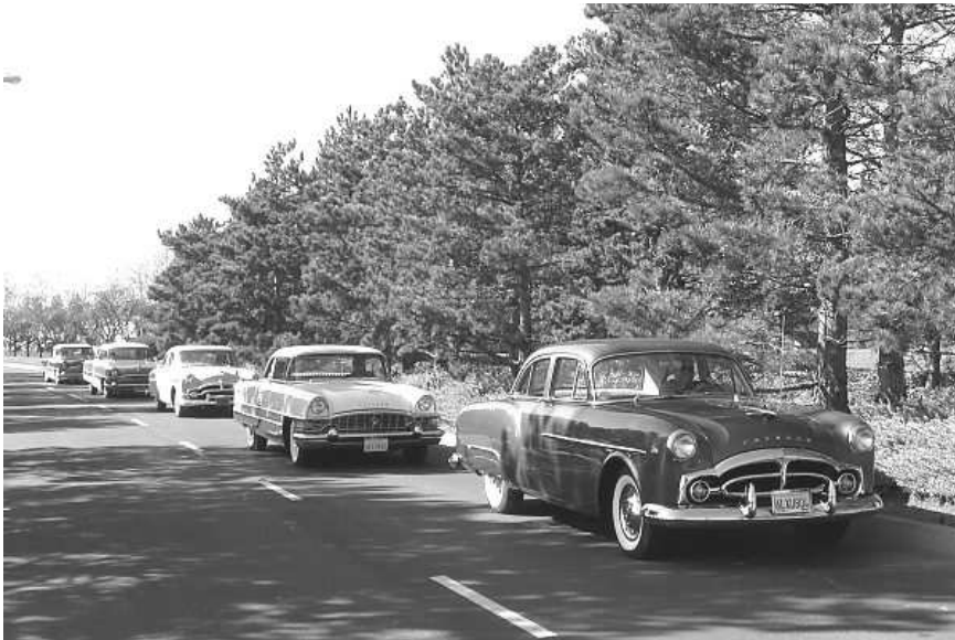
Caravan of Packards.

Our final stop was at Carino's in Fairfield, where we sat in our separate room and had ample time for conversation and conviviality.