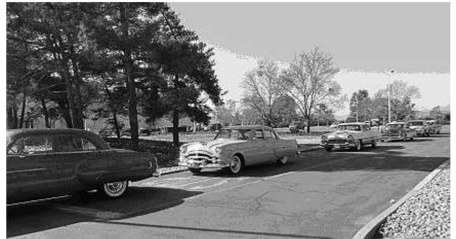
This picture was taken leaving Budweiser, and just before we got lost for the first time.