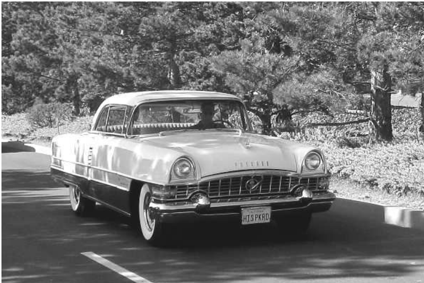
Fred Hill's '55