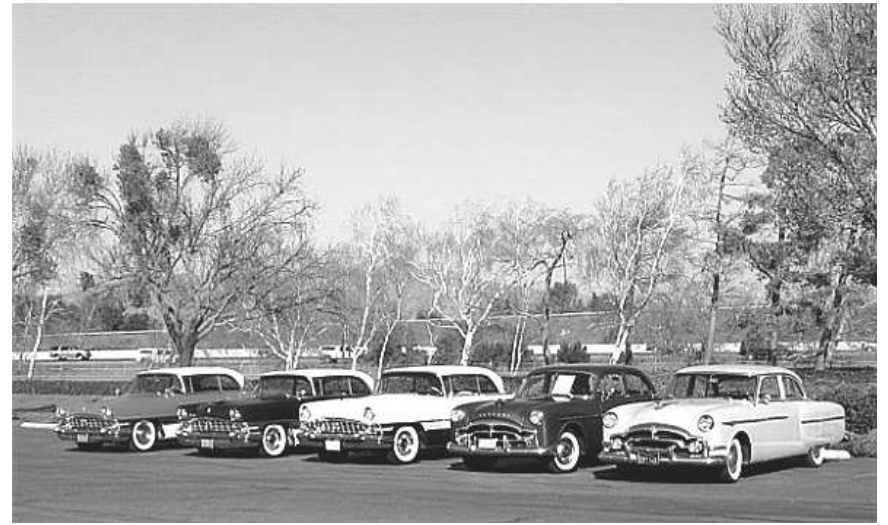
It turned out to be an all Fifties Packard tour.