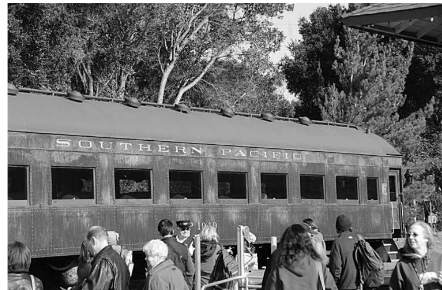
Members entering a vintage S.P. coach