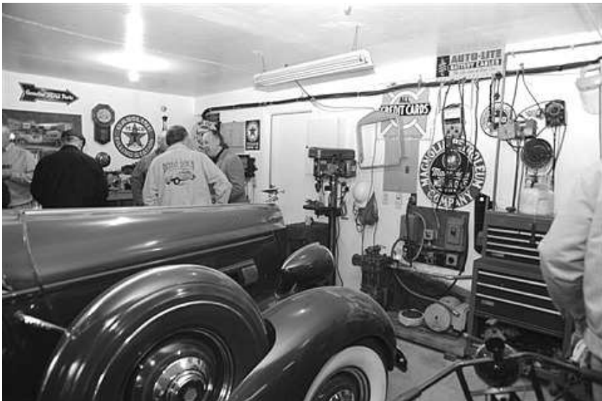
A final view of the McCoy's garage ends our report on the 2011 garage tour.