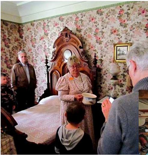
Docent in one of the Patterson house bedrooms.