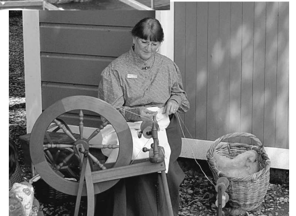
It was fascinating to watch the sheep dogs handle the sheep (top photo some shorn) in preparation for their shearing (middle photo) and to see the wool spun into thread (lower photo).