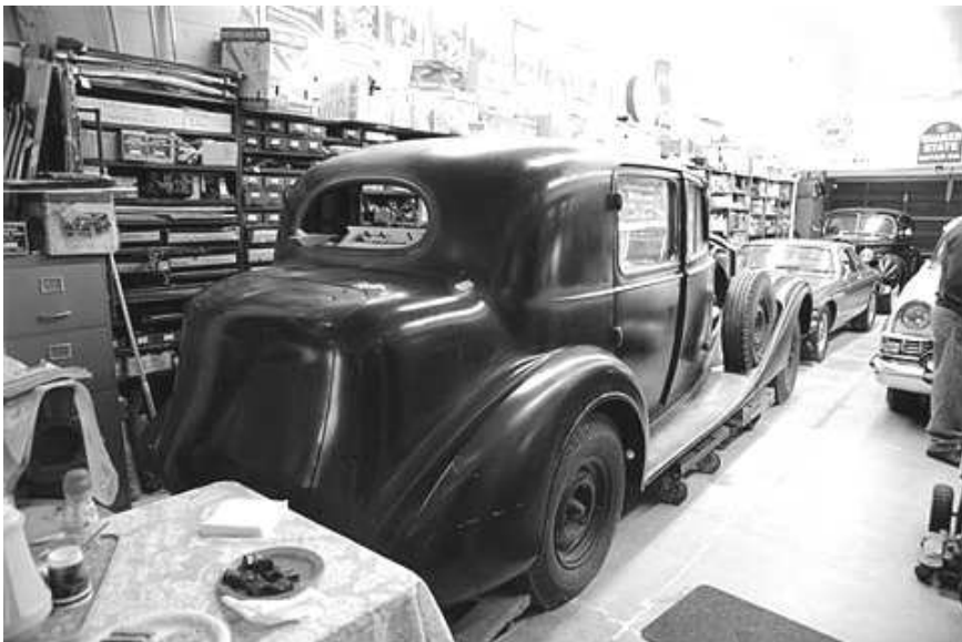
Waiting for its turn for a restoration is this 1937 Twelve club sedan at Fred Hill's garage.