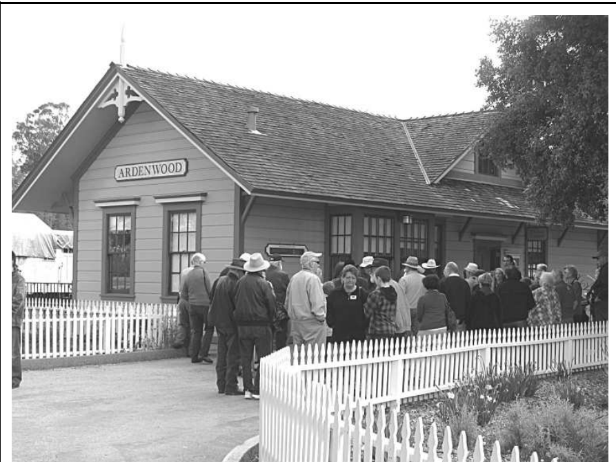
The group entering through the restored train station.