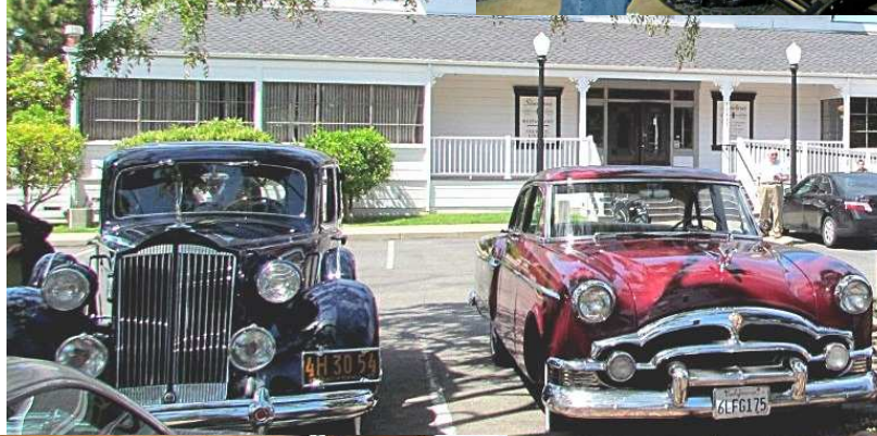
Becks' '37 and Young's '54