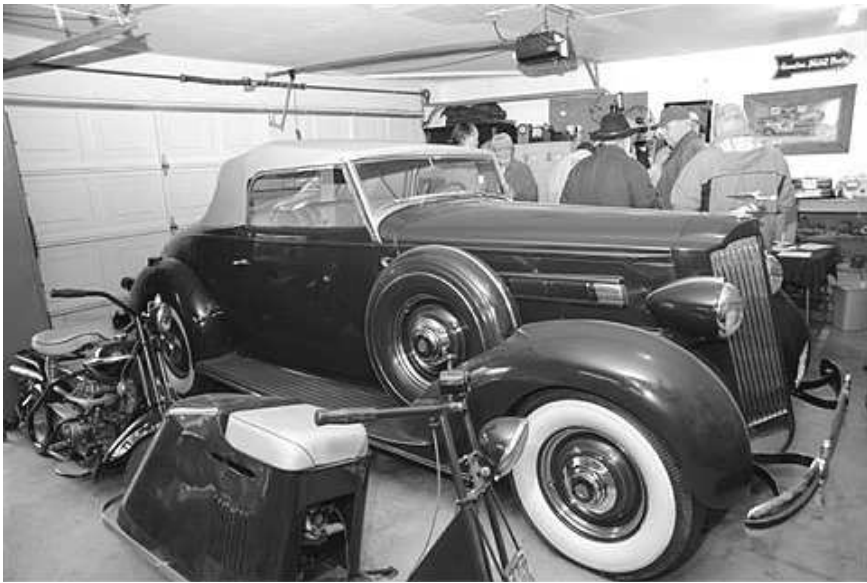
The McCoy's '36 convertible coupe next to a couple of early motor scooters.