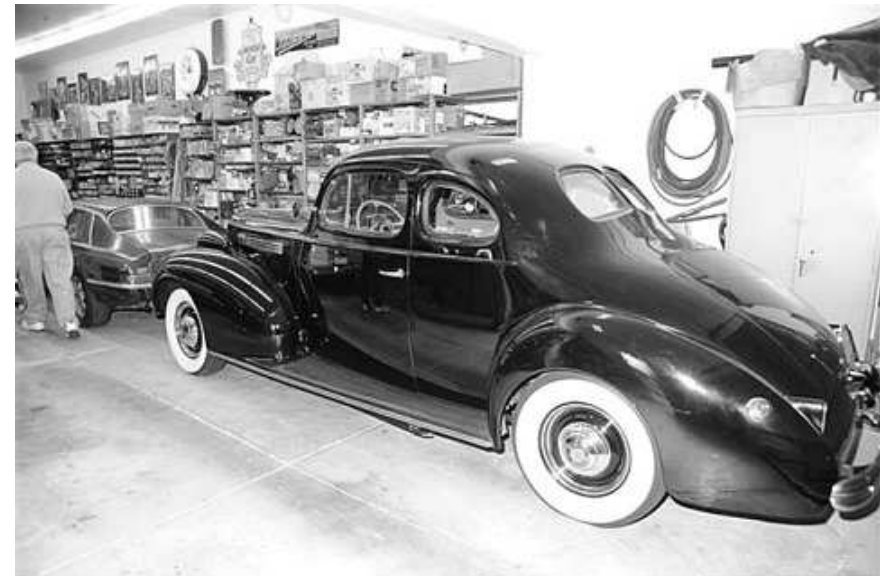
Fred Hill's '39 coupe next to a wall of well-organized Packard parts.