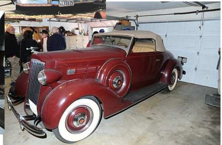
The McCoy's '36