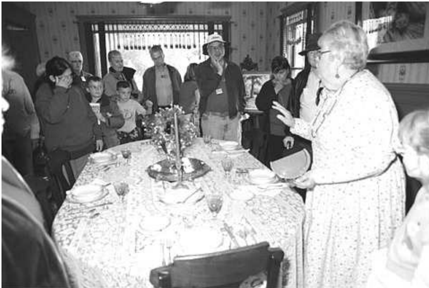
Part of the group in the Patterson house dining room.