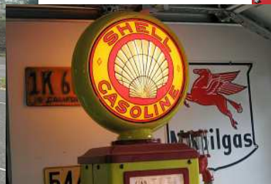
Bob McCoy's Shell gas pump