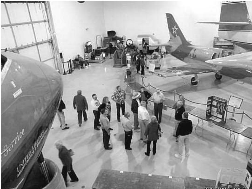
Part of the group among the planes at the Hiller museum.