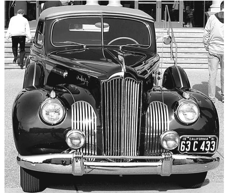
Milt & Carolee Wheeler's '41 160 conv. coupe.