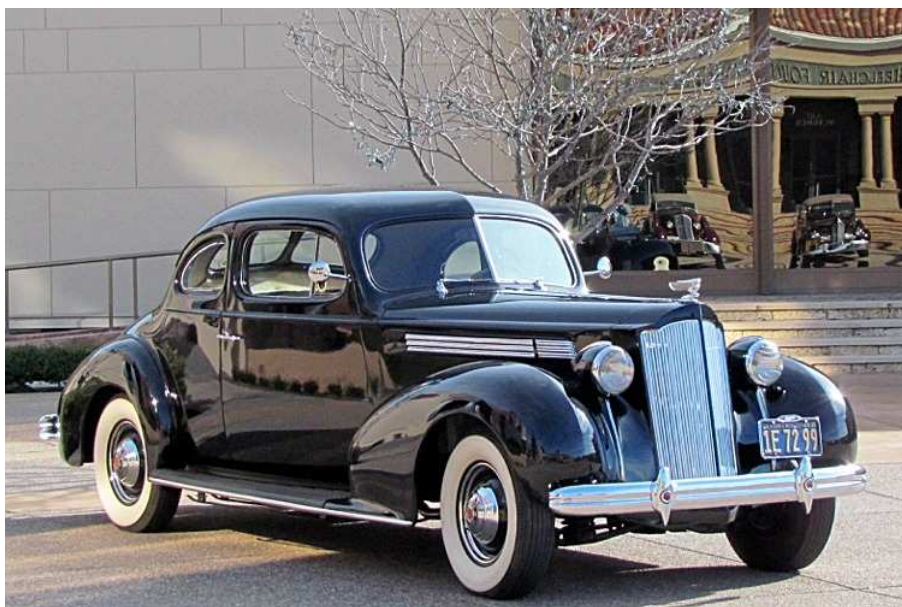
Fred Hill's '39 Eight. Note reflections in the window behind car.