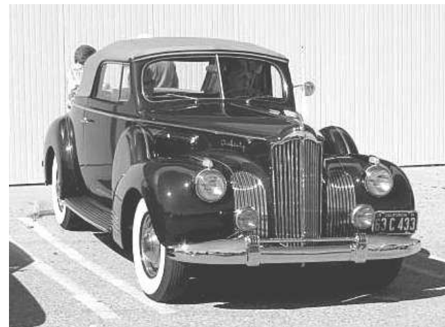
The Wheelers' '41.