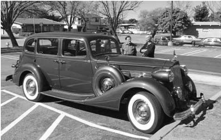
Steve Austin's '37 Super Eight touring sedan.