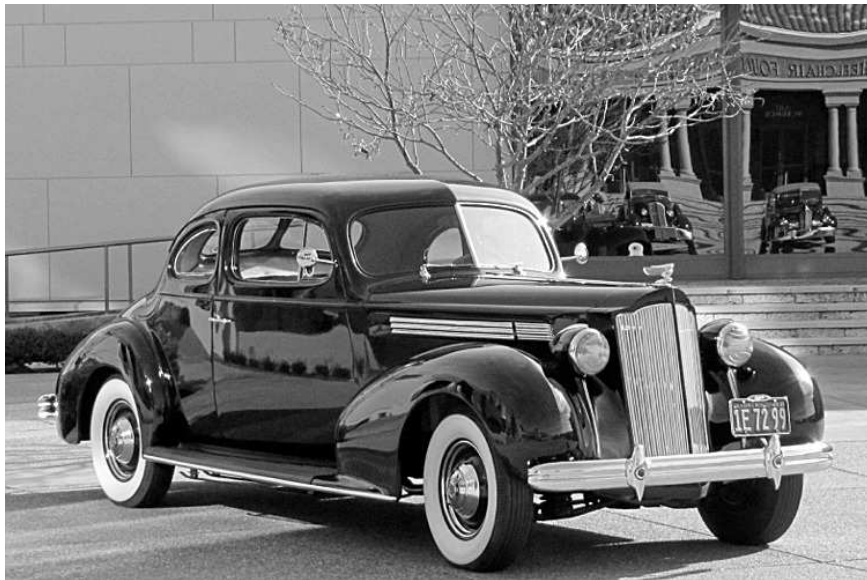
Fred Hill's '39 Eight coupe.