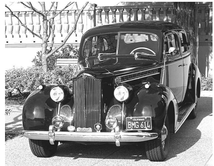
Steve Wier's '40 120 sedan.