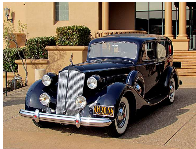
George & Eddie Beck's '37 Super Eight.