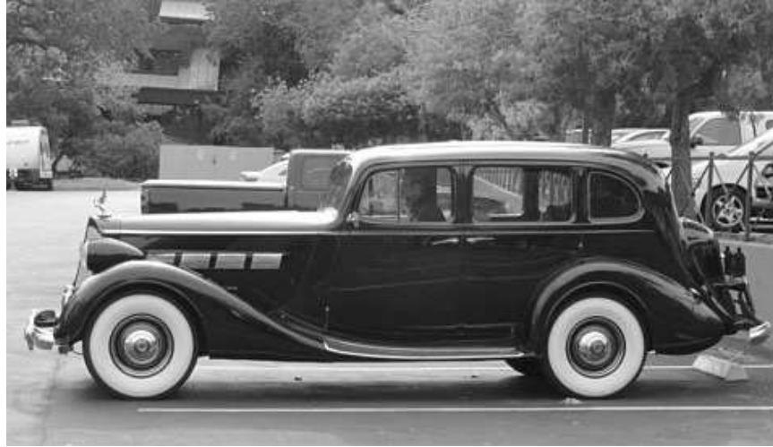
The Mihalys' '37 Super Eight.