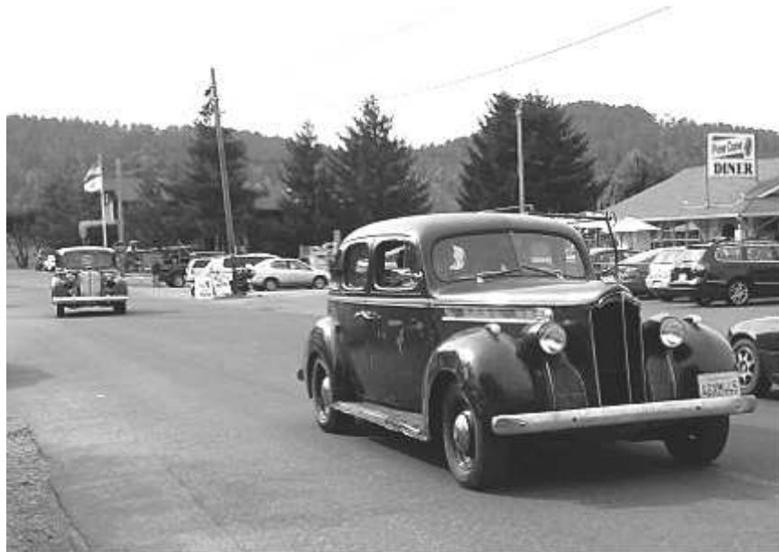
Joe Munsch's '40 120 sedan followed by the Mihalys.