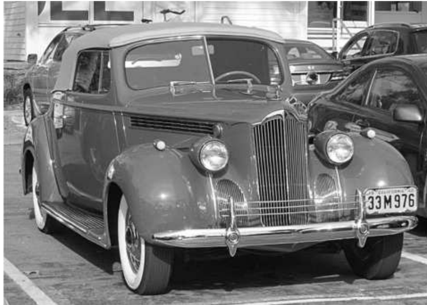
The Tolands' '40 110 convertible coupe.