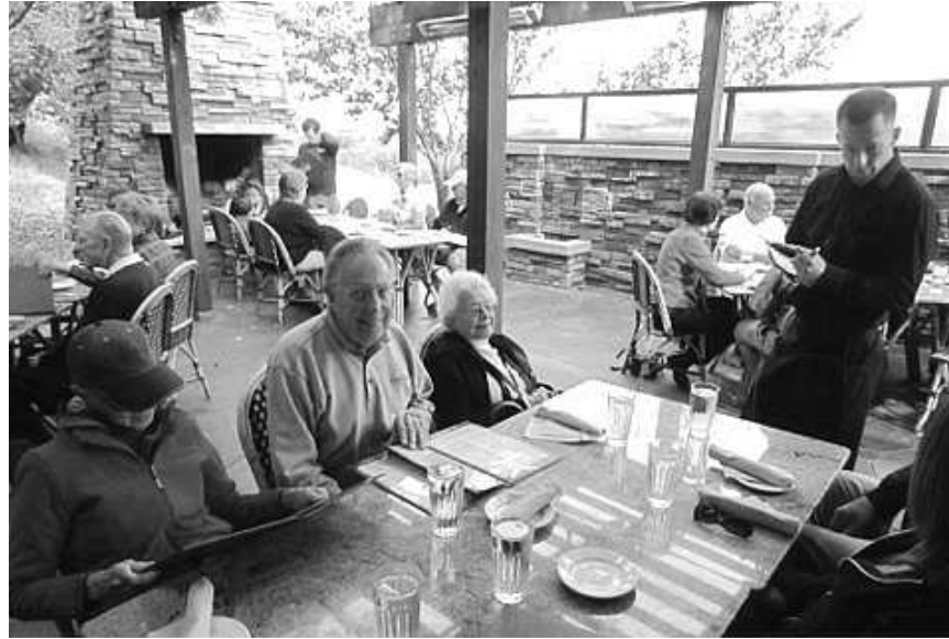
Lunch at the Wildfox restaurant.

This was an opportunity to drive our Packards to popular cheese factories in Marin County. The total Drive was 55 miles and took us from Larkspur Landing to Pt Reyes, Nicasio, and Novato.