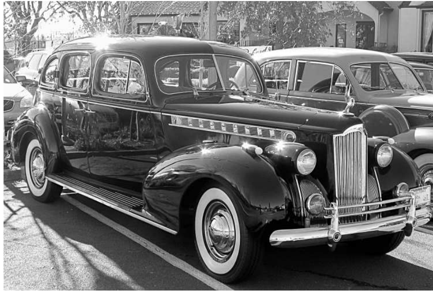
The Nortons' '40 160 touring sedan.