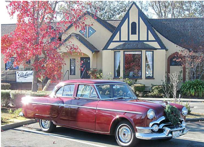
Bill Young's '54 Clipper DeLuxe in front of Zio Fraedo's Restaurant for the Holiday luncheon. Note: wreath on front.