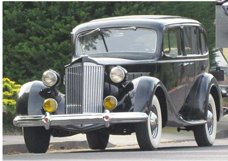
Mihalys' '37 Super Eight at the Marin cheese tour.