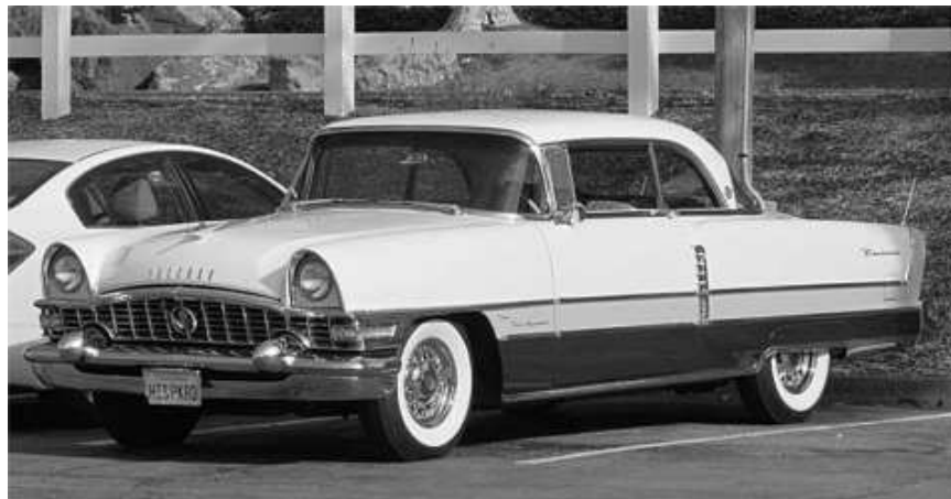
The Hills' '55 400.