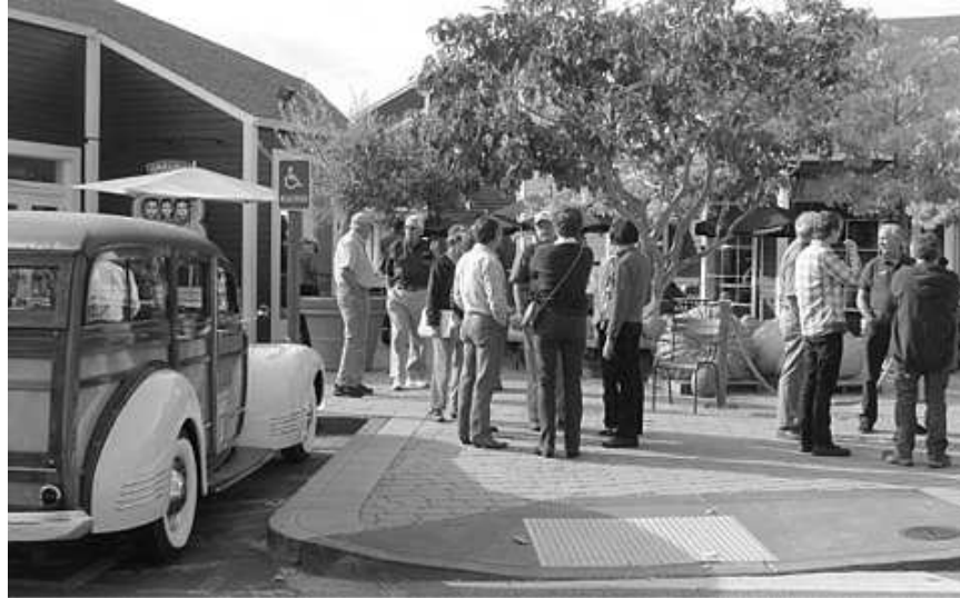
Packard talk next to Carpenters' station wagon.