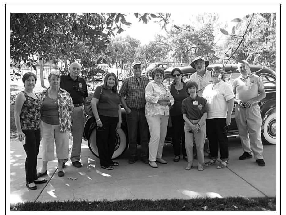
Group shot in the Pavas' driveway.