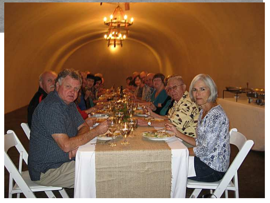
Dinner at the Cielo Winery was in their underground wine cave.