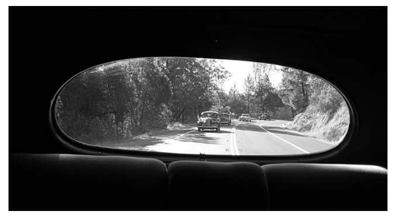
An interesting shot out the back window of the Pavas' car.

We enjoyed hosting this tour and look forward to doing something similar in the future.