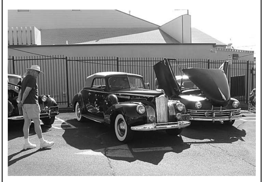
Milt Wheeler in his '41 160 pulling in next to a modified car.