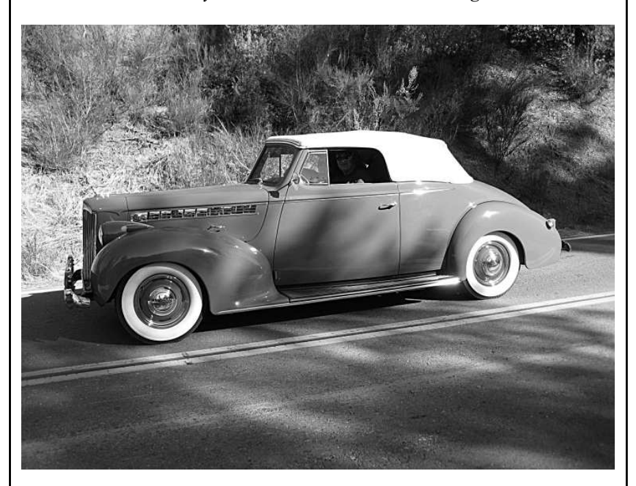
Tim and Kathie Toland in their '40 110 convertible coupe.