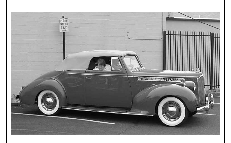
Tim and Kathie Toland arriving in their '40 110 convertible coupe.