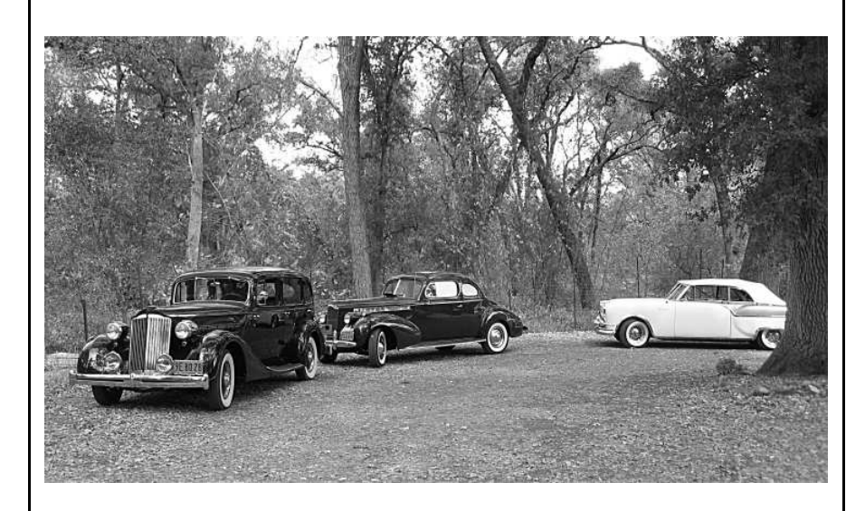
The Pavas' '36 1400, Ulrich's '40 120, and the Vassars' '54 Caribbean.