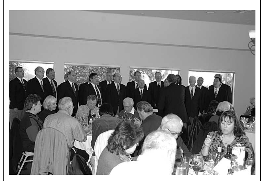
The Bay Area Men's Chorus.