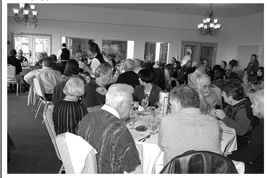
Dec. 7: The setting for the Holiday Banquet was a very nice dining room overlooking a yacht harbor. A fitting end to a great tour season.