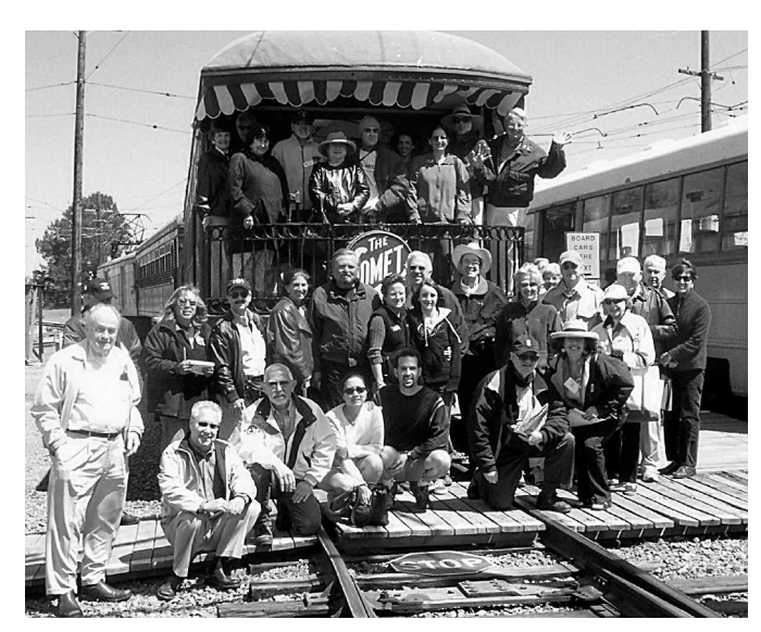
April 19: The Rio Vista Railroad Museum.