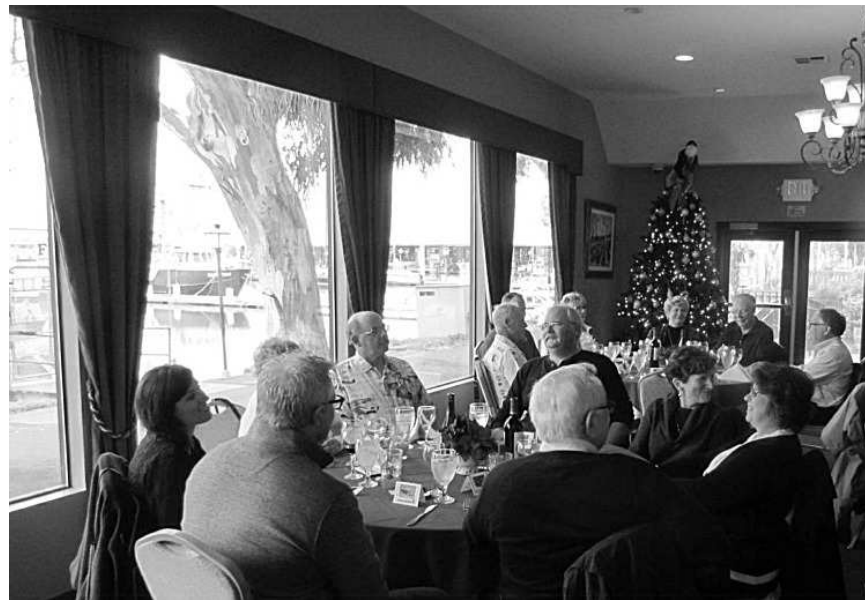
Our dining room included a Christmas tree in the corner and a nice view of the boats in the Marina.