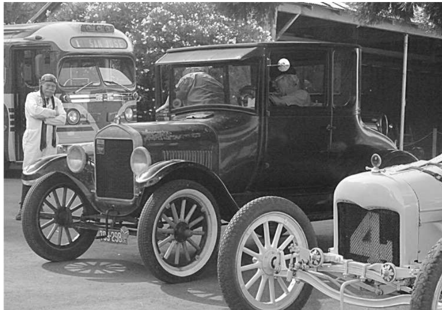
Horseless Carriage Club cars with a bus from the Fremont Bus Museum in the background.