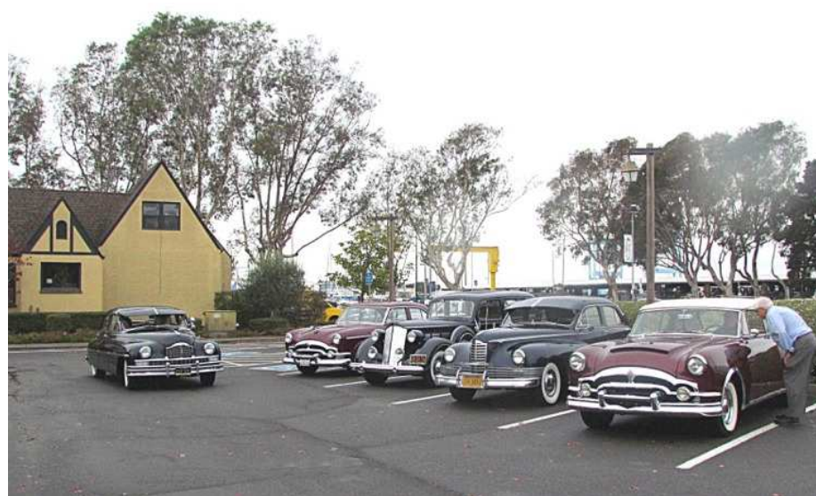
Brave members proved that Packards don't melt in the rain.