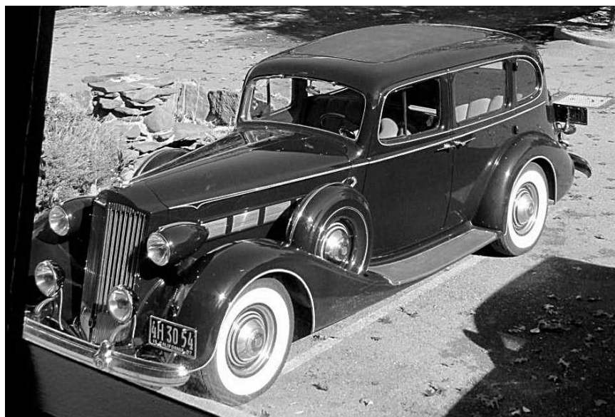
George & Eddie Beck's '37 1501 Super Eight sedan.