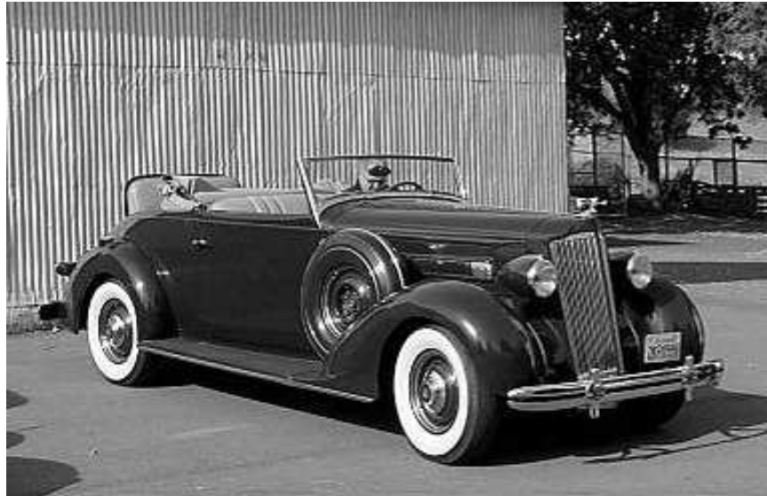
The McCoys' '36 120B 999 convertible coupe.