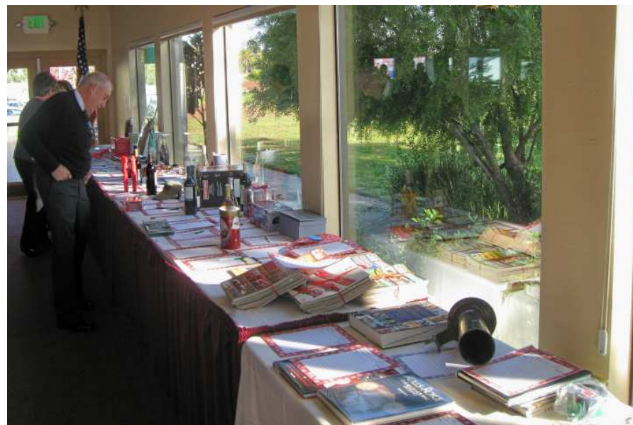
The raffle table always holds treasures.