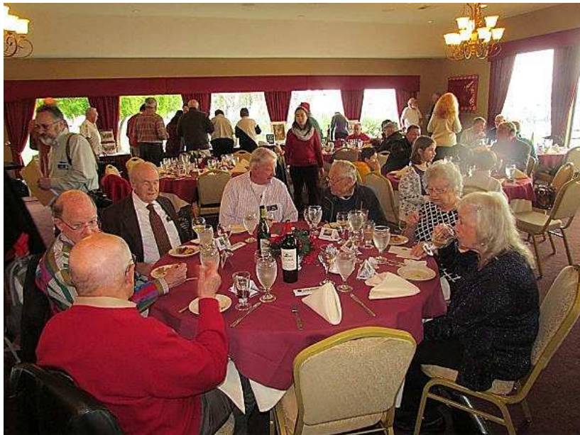
The Holiday Luncheon room was warm and inviting.