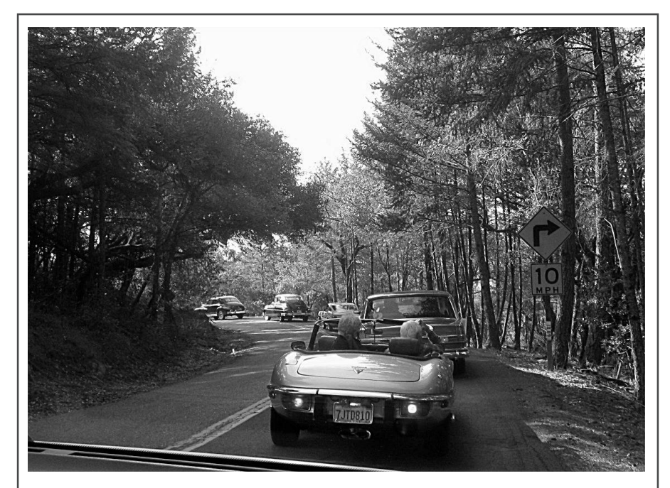
Caravan on the winding road to the Matthews collection.