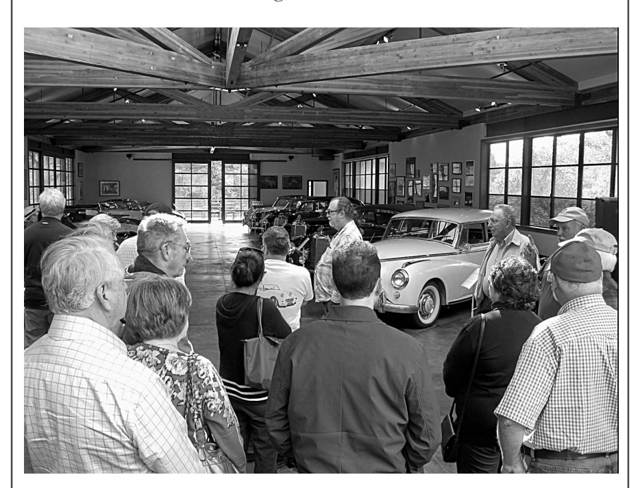
The group listening to our host tell of his collection..