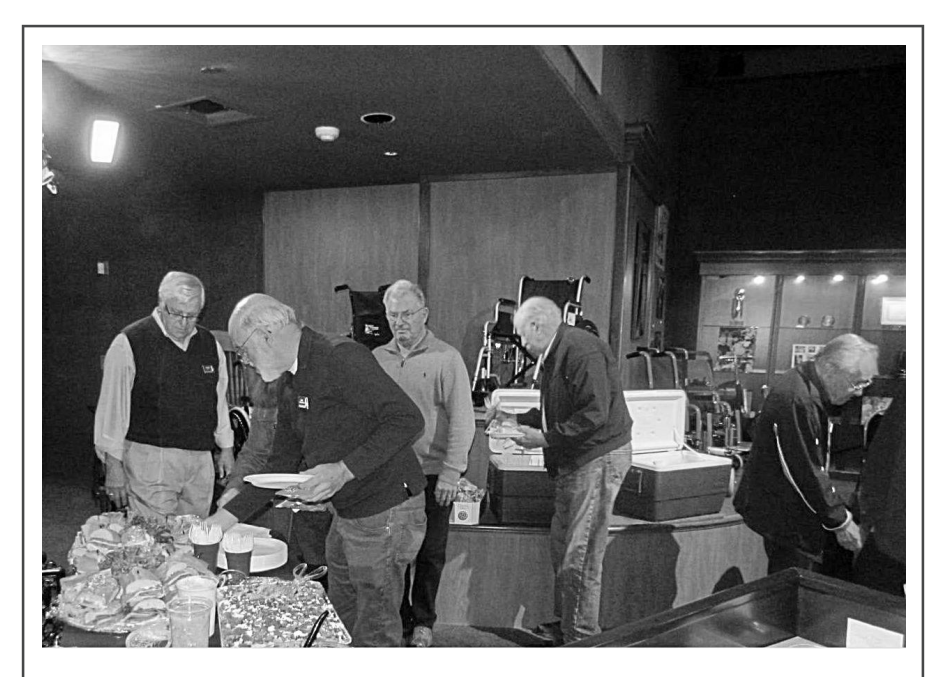
A nice buffet lunch was enjoyed by all.