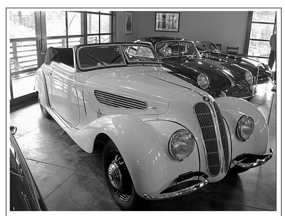
A rare 1937 BMW convertible.