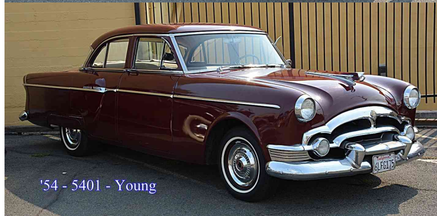
'54 - 5401 - Young