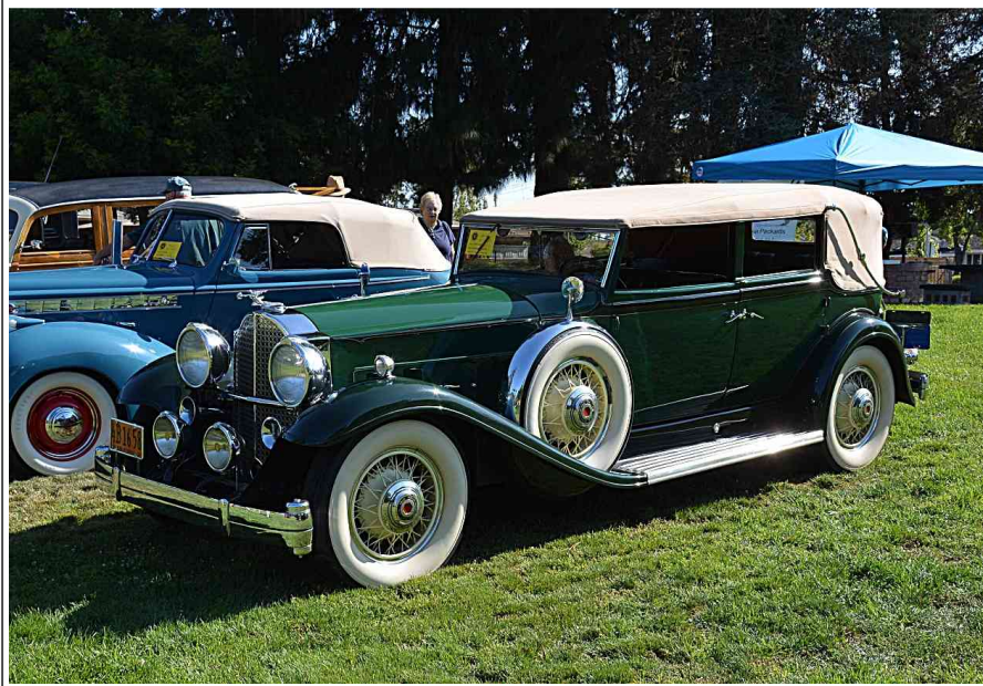
Clint Moore's '32 903 Dietrich convertible sedan