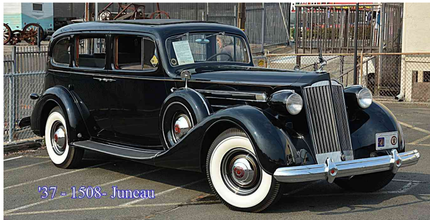
'37 - 1508 - Juneau