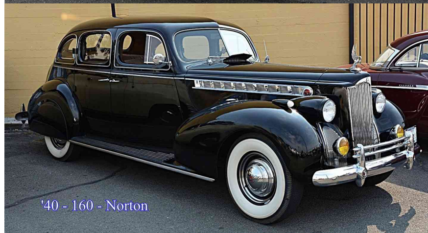
'40 - 160 - Norton