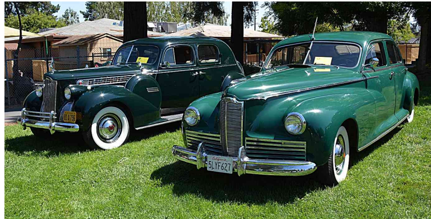
The Butterworths' '40 1806 club sedan (left) The Bretts' '41 Clipper Eight sedan (right)