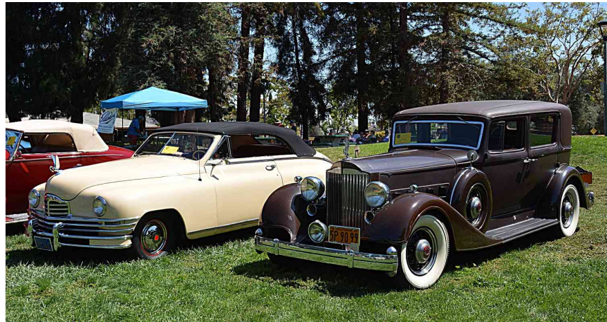
Milt & Carolee Wheeler's '48 Super Eight convertible (left) Stuart Hunter's '34 Twelve formal sedan (right)