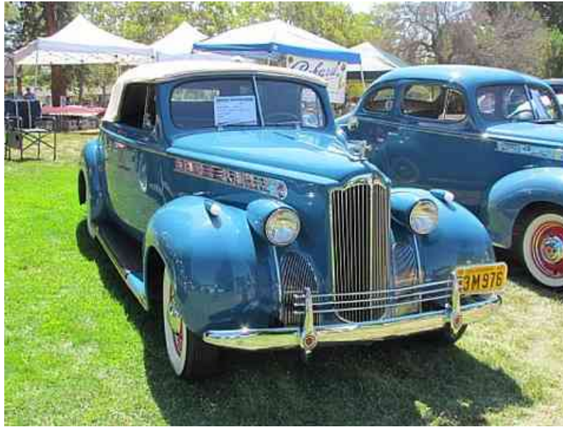
Tim & Kathie Toland's '40 110 convertible.