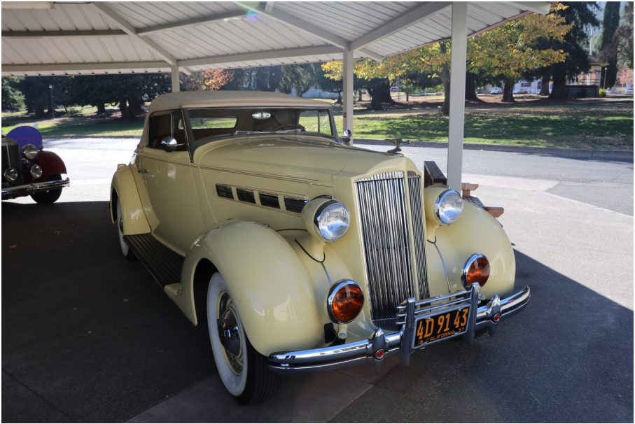
Chip Flor's 1937 120C Convertible Coupe on display at the Veterans Home.