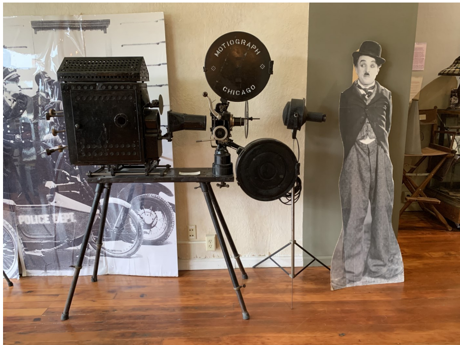
Charlie Chaplin’s tramp character stands watch near a vintage projector in the Niles Essanay Silent Film Museum.