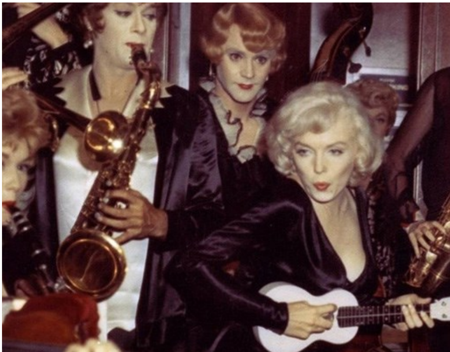
Practicing for the show: Tony Curtis as "Josephine" on saxophone, Jack Lemmon as "Daphne" on bass, and Marilyn Monroe as "Sugar" on ukulele in the hilarious movie day feature film Some Like It Hot.